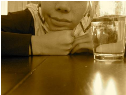
Is this glass half full or half empty?

Everyone talks about positive thinking and often it is the first thing that comes to people's mind when they hear the term mental training. Repeatedly I have heard comments such as "Yes, I know, positive thinking ...." Occasionally I sounded out of the remarks: "This is not always the riddle's answer.", "It is not as simple as that." The questions are: Why is positive thinking on everyone's lips? What is the power of positive thinking? Is it really a universal cure?